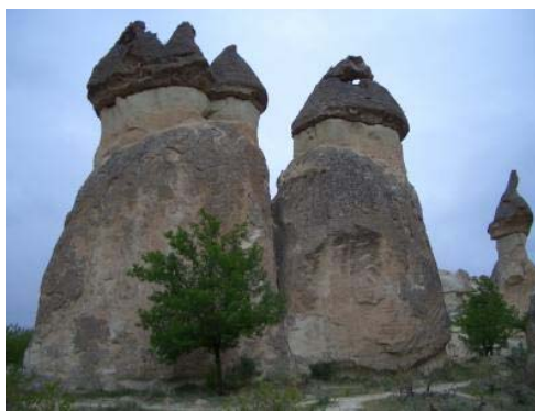
Figure 1 and 2. Form-formation