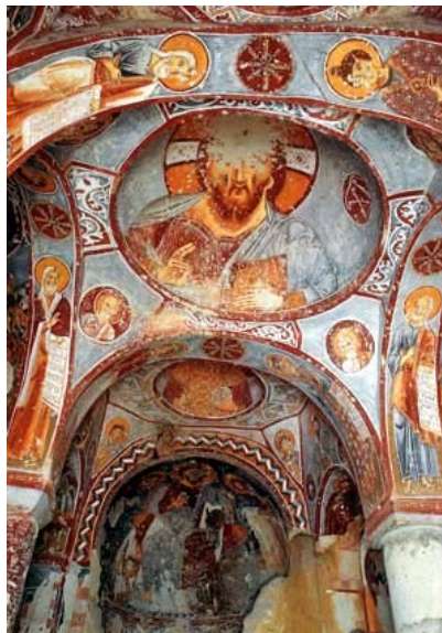
Figure 4. Form-composition

The illustrations are from Cappadocia, Turkey.