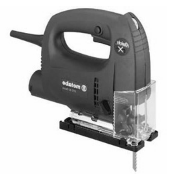
Figure 1. Jigsaw

We want here to practically apply the Usage Coverage Model to check if a given sized design of a jigsaw matches a given usage need. Its expected usage is "to cut wood dowels and boards of defined materials and dimensions". The jigsaw is visible in Figure 1 and the modeling of its design parameters is provided in Figure 3.