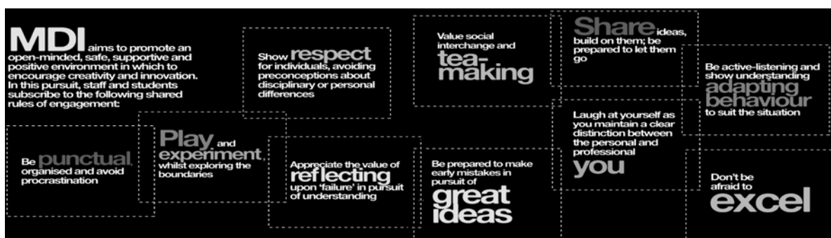
Figure 3. Terms of Engagement

We have shown how this new programme has been developed from sound principles and direct observation of multidisciplinary innovation practice in action. To date, students have worked successfully with such organisations as The MS Society, BBC, Mars, Unilever, Berghaus and Sonoco Alcore as well as a host of regional SMEs. Fundamental to sustaining this success is the honesty and commitment of stakeholders learning how to communicate and work together. We need to look to our students as partners in this research. We give them the last words as they explain through their Terms of Engagement (Fig. 4) the factors that they believe are essential to support their multidisciplinary innovation practice.