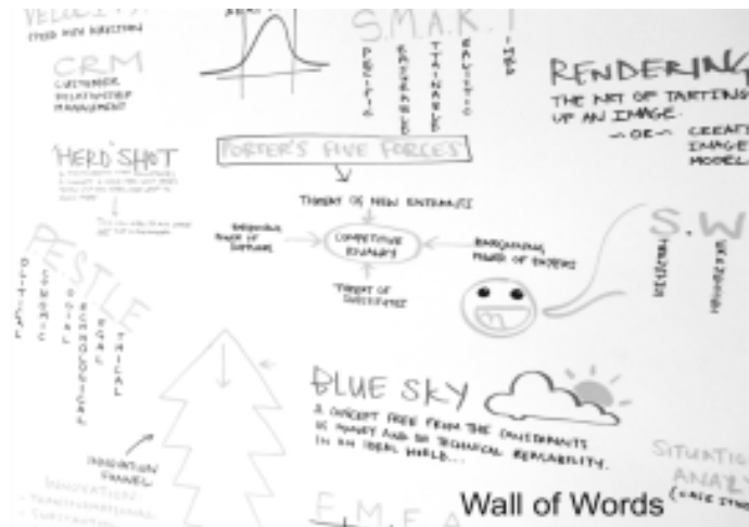
Figure 2. 'Wall of Words'

different group members. The innovation we each saw here was that no-matter what the idea; each member added something to it to turn out the concepts.”