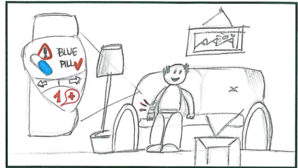
Fig. 8. An example concept frame for the elderly

Group 4: The concept for the elderly is to support them to manage everyday's healthcare activities and to improve information exchange between doctors and patients.