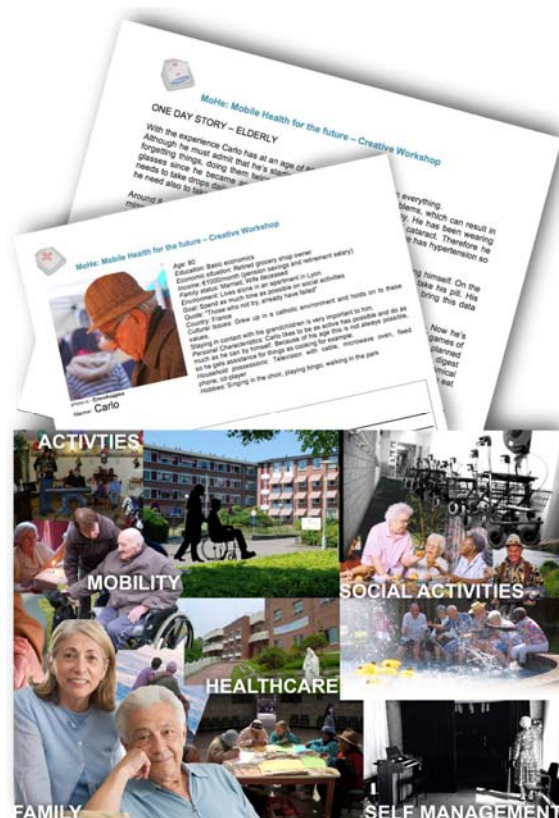
Fig. 2. Personas / One day Story / Moodboard

The following tools were used to summarize the specifications of each user group emerged in the research: a persona resuming users' characteristics and condition, a moodboard representing their emotional status and desires, and a "one day life story" developed together with possible characters from the user groups(i.e. a grandfather, a pregnant mother with a 3 year old daughter, a 40 year old professional worker and a 12 year old girl jointly with an endocrinologist) (Fig. 2).