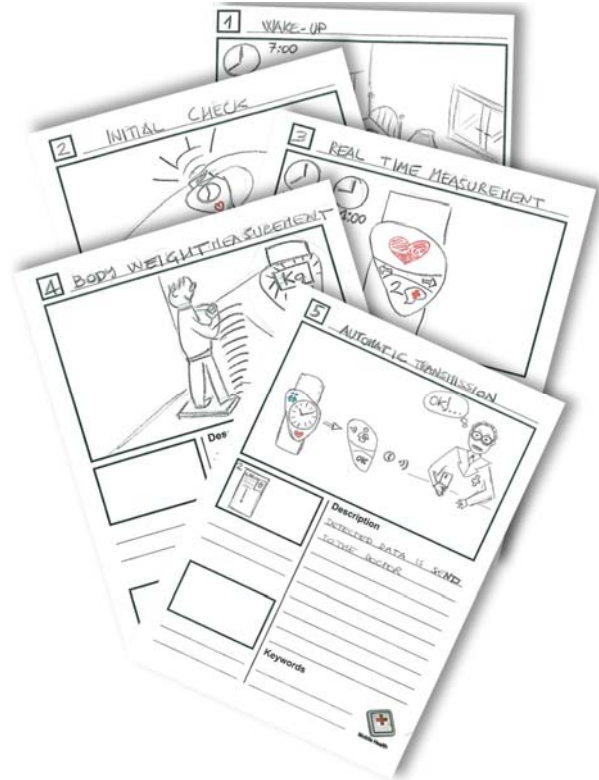
Fig. 4. An example of single detailed frames

As an outcome, each single frame with a 16:9 format as a was sketched with a detailed description on the idea. Then, each single frame was compiled in a 20 frame storyboard as a result of the proposal in order to be compatible with movie production. The participants of each group also presented their opinions for the mood of music, voice type of narrative speakers, 3D models and 2D visualizations of the possible scenarios.