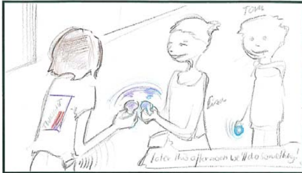
Fig. 6. An example concept frame for kids

problems to other user groups like adolescents with chronic conditions as the devices have been made with little or no consideration for their specific needs (Lang et al. 2010). The concept for kids is an object with special features for the kid users. It also provides instant messaging and short range communication in order to enable a less expensive social interaction. This is also applied to improve the quality of life of kids with chronic diseases.