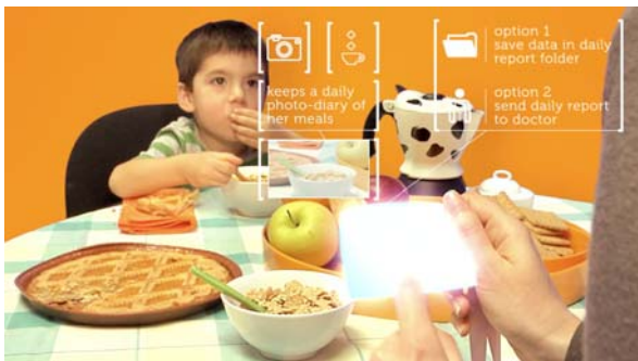
Fig. 9. An example of final movies