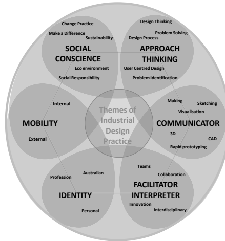
Figure 2. Thematic Map of Australian Industrial Design Practice

The themes were developed through both top down testing and application of a priori themes postulated before the analysis began, and by a bottom up process of development based on interview data. Key commonalities emerged from the rich and informative interview data of the graduates lived experiences. The themes, and their relationships, were visualised by means of the Thematic Map of Australian Industrial Design Practice . This Map illustrated the depth of skills and knowledge which contemporary industrial design graduates draw upon in their various forms of practice.